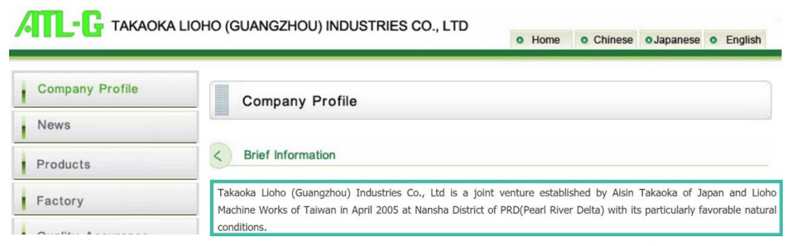
<sup>9</sup>

Another automotive component producer jointly founded by Lioho Machinery and ADVICS is ADVICS Yunfu Automobile Parts Co., Ltd.<sup>10</sup> In September 2015, Yunfu's EPB discovered that the factory had violated the "Three Synchronizations" regulation by commencing production before the supporting environmental protection facilities passed inspection. On top of this, the factory's discharge permit had already expired.<sup>11</sup>