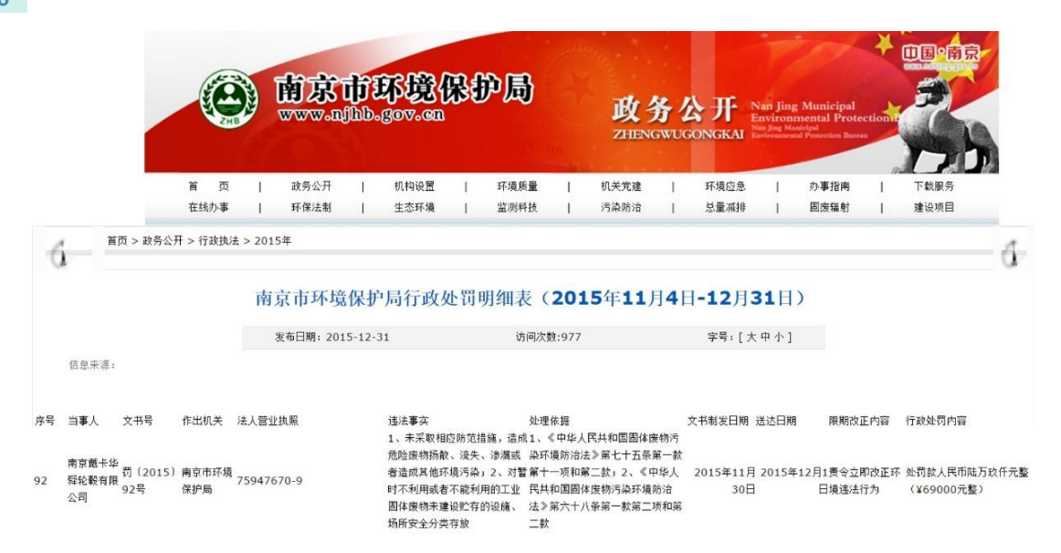
(Image from Nanjing Environmental Protection Bureau website<sup>16</sup>)