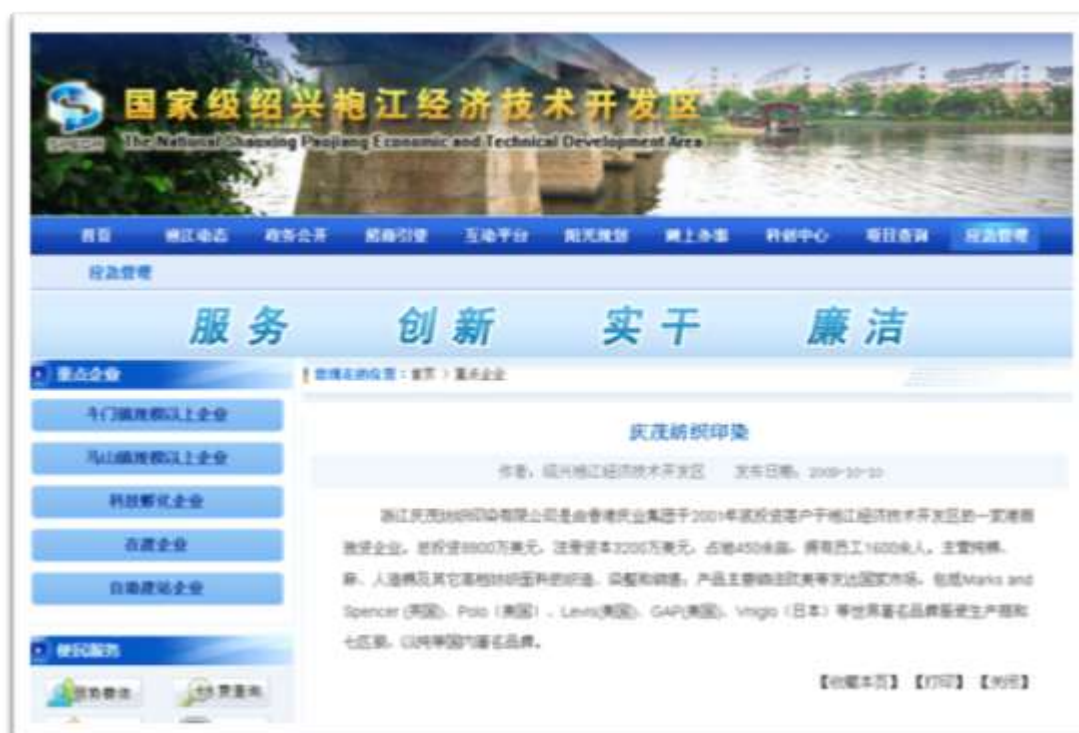
National Shaoxing Paojiang Economic and Technological Development Zone Website

Zhejiang Qingmao Textile Printing and Dyeing Co., Ltd. is located in Shaoxing City’s Paojiang Industrial Zone. On the official Paojiang Economic and Technological Development Zone website, M&S is first in a list of brands buying from the company.