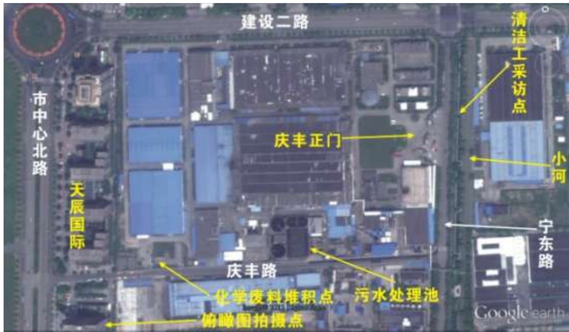
Google Earth view of Zhejiang Qingfeng and the surrounding area