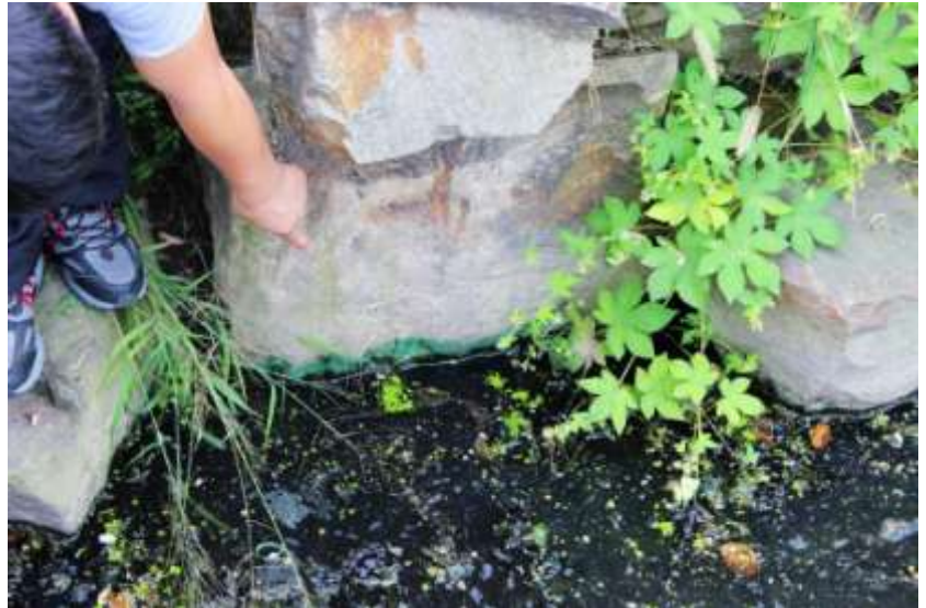
Discharge channel colored dark green

Records of violation from other suspected suppliers to Marks & Spencer