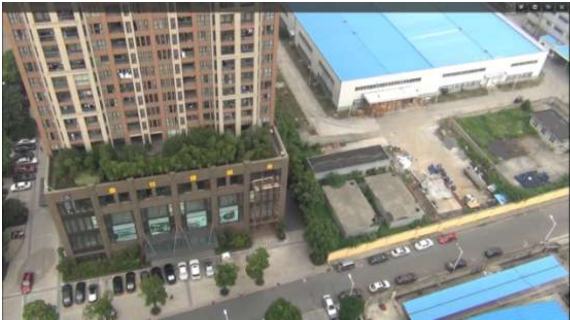
Only a wall separates Zhejiang Qingfeng's eastern border and Tianchen International

In September 2012, environmental NGOs went twice to Xiaoshan in Zhejiang to carry out investigations into the pollution problems at Qingfeng. During the investigation on September 10 th , staff from Wenzhou Green Eyes and the IPE, on the opposite side of the “Black Colored River” to Qingfeng met an elderly street cleaner. Every day he cleans the street in this area and he said that the “Murky Black River” flows directly into the Qiangtang River. When the river level goes down it is possible to see the large discharge pipe from Qingfeng directly discharging into the river. Sometimes when the discharge volume is very large it is possible to see white foam forming.