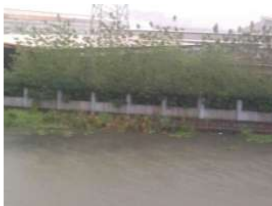
Black water coming from the discharge outlet from the wall.

The residents feel that the waste gas emissions from Qingmao have had a serious effect on their health. One of the residents said, “We can’t stand it, it’s killed so many people. So many people