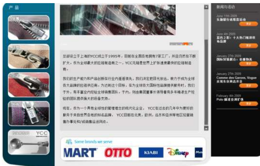
Shanghai YCC Co., Ltd's Website