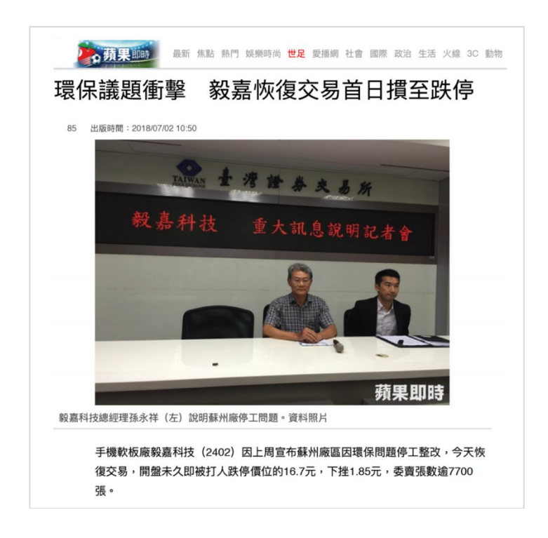
Note: All of the above quotes have been translated from Chinese by IPE for the purposes of reference only. For their original text, please refer to the Chinese version of this report.

According to relevant information on a financial platform: "The mobile phone motherboard factory Ichia Technologies (2402) announced last week that due to environmental issues at its Suzhou factory, it would halt production and undertake rectification actions. As trading resumed today, company shares closed at (TWD) 16.7 shortly after the market opened, falling by (TWD) 1.85."